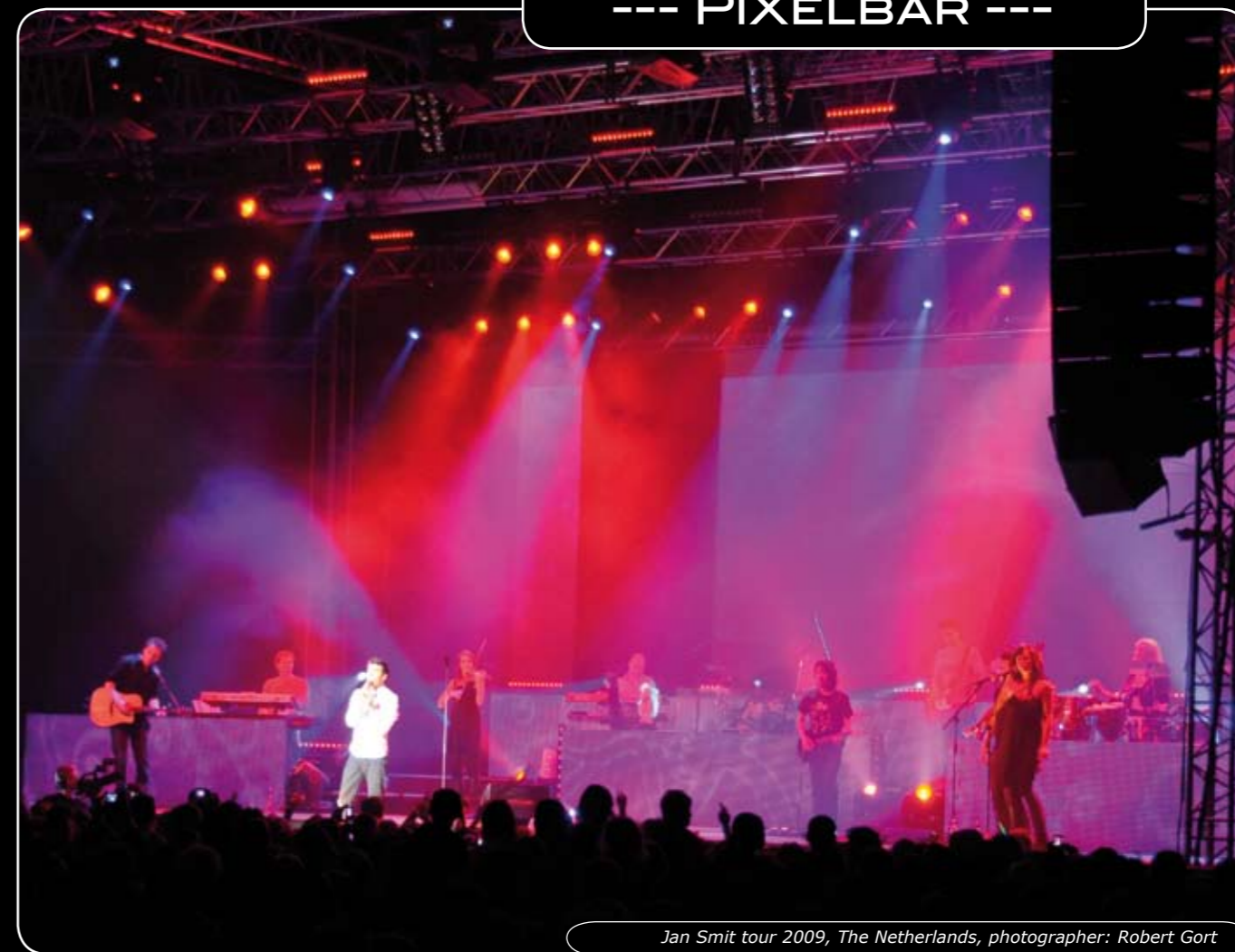
Jan Smit tour 2009, The Netherlands